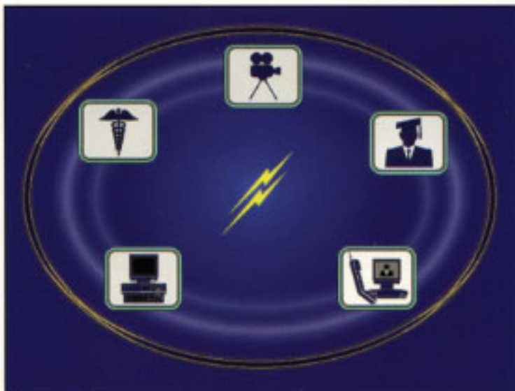
MuTIpoint system gets you up and running fast.

We combine consumer know-how with technical expertise, a vast global base of resources, and an award-winning focus on quality. Add to that our traditional strengths in complex systems integration, and we are clearly the logical technology partner.